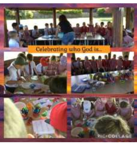
Paper plate spirals with the parent prayer group