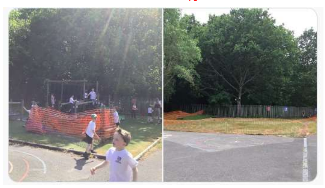
Now you see it, now you don't....!

You may have noticed that our adventure playground has disappeared...watch this space for exciting developments!