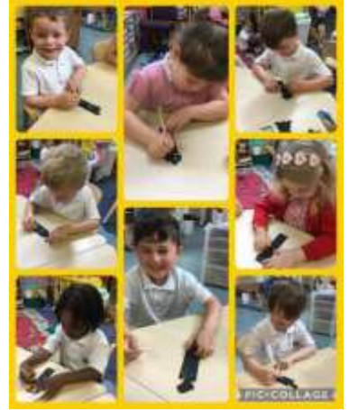
Be the light bookmarks – we can be light in the world

We hope that children have come home talking about what they experienced during the day. Here are a few pictures that might help you to start those conversations.