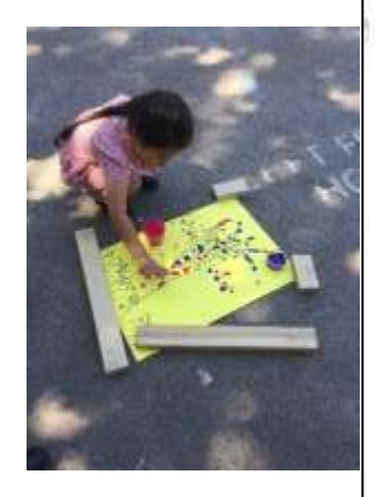
Fingerprint prayers – we are unique