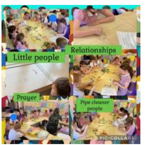
Praying for those who are special to us with Kat